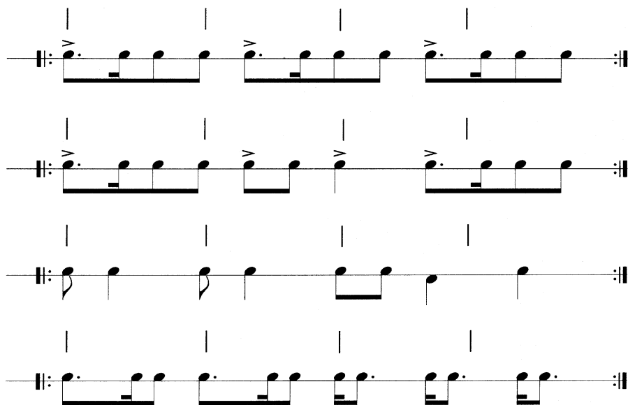
Fig. 3. African 3:4 rhythms (Arom 1991:243, adapted). The thin vertical lines are sometimes clapped, sometimes danced.

from the sixties. The smallest common denominator of all these subdivisions is a microscopic fraction of a beat; no one can hear it, much less count it.