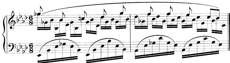
Fig. 1. Complex hemiola in Chopin, Ballade No. 4 , mm. 175-76 (Hofstadter 1985:179 adapted).